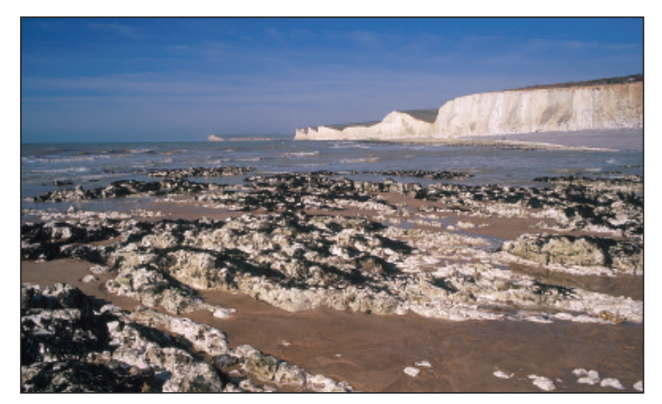
The Seven Sisters from below Birling Gap at low tide.