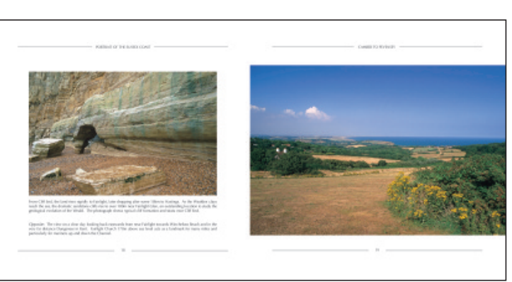
Example of a double page spread.