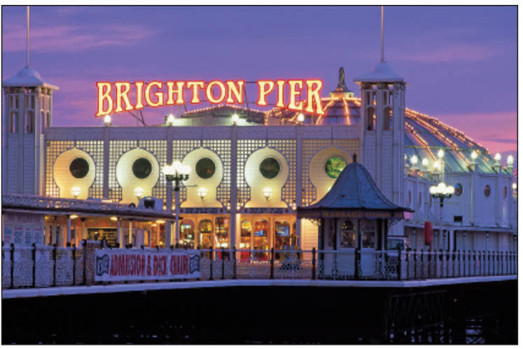
Brighton Pier at dusk.